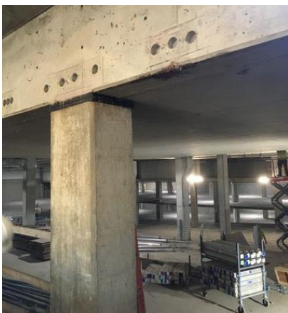
View under Main Theater slab with shoring removed.