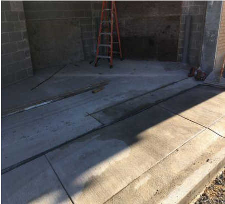
Poured Curbs and Final Site Grading